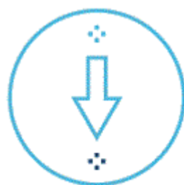
New Normal Lacks Appeal