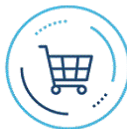
Purchasing Triggers Diminished