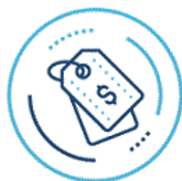
Economic Reality Hits