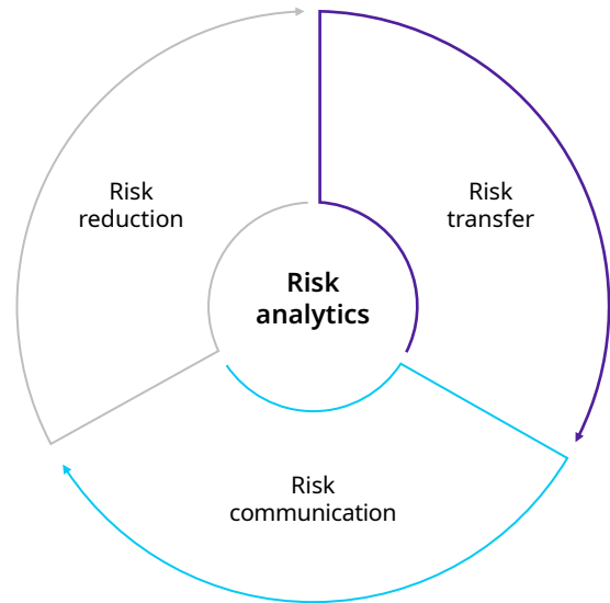
Exhibit 2: An integrated program of risk management

The CBCI policy could be for a single hazard, such as flood, or for multiple hazards, such as both flood and wildfire. Although the community insurance concept can extend to any risk — for example, community health 4 — this paper focuses on natural disaster cover. Some communities may face substantial risk or insurance gap issues for only one peril, while many other communities may be at risk from multiple disasters and have limited insurance coverage for all of them. We heard from at least one local stakeholder that uniting flood and earthquake, for example, could make the product more attractive to communities and their residents. A multiperil approach may also integrate better into an overall program of disaster risk management. 5 This is critical since insurance is most effective when it is tightly coupled with risk reduction and risk communication programs, as shown in Exhibit 2. Risk reduction should be seen as a complement to insurance, since lowering a risk can make insurers more willing to insure a peril at a cost to the insured that is affordable. Risk communication supports both risk reduction and risk transfer by improving awareness among those at risk and helping community leaders understand the nature of the peril and how to protect against it. Importantly, science-based risk analysis is central to informing all three elements in this process and is explicitly a byproduct of investing in risk transfer.